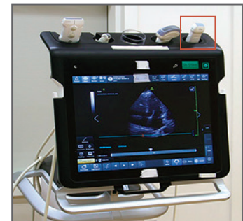
Figure 2. Ultrasound Machine with Phased-Array Probe.

Shown is the heart in the apical four-chamber plane.